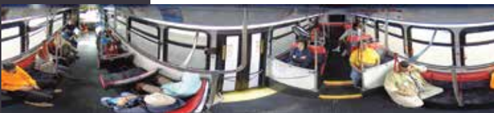
Panoramic + 4 Cameras Views