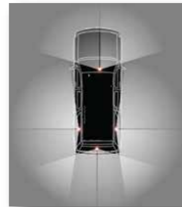
360° COVERAGE (Inside/Outside vehicle)